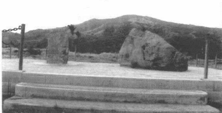
The newly re-sited memorial rocks about 300m north of Yacht Club site - Left, the Montevideo Maru rock, Right, the Rabaul 1942-45 rock

The Montevideo Maru memorial rock, and the large Rabaul 1942-45 memorial rock, which were some 50 metres apart, were joined together on a large single cement platform by Office of Australian War Graves in late 2002. These were previously buried in the eruption of 1994. The present venue is approximately 300 metres north of the restored Rabaul Yacht Club. On walking along the beach, I located the former Montevideo Maru cement obelisk which was erected on the beach near Wharf Street near Toboi, subsequently around 1970 moved further around the harbour and was washed away in the 1971 tsunami. Following this, the memorial rock was erected. Both of these rocks are a tribute to the great loss of life in the darker days of Rabaul during WWII.