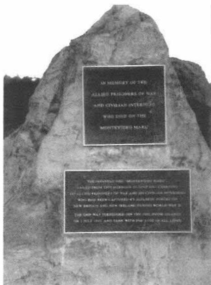
Montevideo Maru Memorial Plaque

The Montevideo Maru memorial rock, and the large Rabaul 1942-45 memorial rock, which were some 50 metres apart, were joined together on a large single cement platform by Office of Australian War Graves in late 2002. These were previously buried in the eruption of 1994. The present venue is approximately 300 metres north of the restored Rabaul Yacht Club. On walking along the beach, I located the former Montevideo Maru cement obelisk which was erected on the beach near Wharf Street near Toboi, subsequently around 1970 moved further around the harbour and was washed away in the 1971 tsunami. Following this, the memorial rock was erected. Both of these rocks are a tribute to the great loss of life in the darker days of Rabaul during WWII.