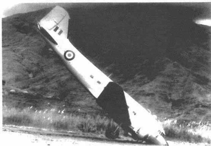
Douglas DC-3 (A65-124) up on its nose at Finintigu, 1 April 1952

The pilot closed the throttles, immediately re-opened them and stood the Dakota beautifully on its nose. It hung there momentarily, like a poised ballerina, then settled gracefully back on the tail wheel.