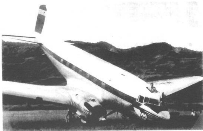
DC3 in the kunai with its propellers in soft soil - Kaiapit, 1952

We examined the aircraft and found the propellers firmly stuck in the soft soil and it was this which was holding the aircraft in position. What had caused this near calamity? The aircraft had flown direct from Port Moresby to Kaiapit and, unknown to the aircrew, the starboard tyre had gone flat in the air after leaving Moresby.