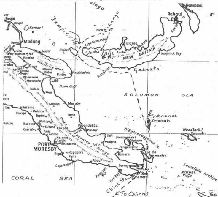
Route taken by Gladys Baker from Iboki, New Britain, to Cairns, early 1942

up my face was covered in a black scum of oil, and pitch from the decking had blackened my back. I saw then that three of the boys had spread a sail over the decking and pretended to mend it all the time the Japanese were on board.