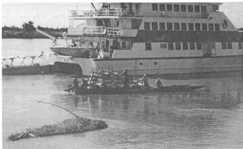
Desk-delivery, Sepik style