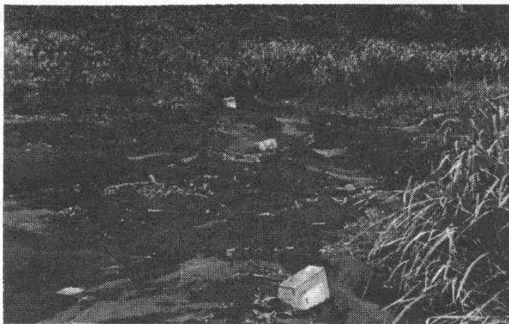
European cemetery covered by ash - five headstones exposed by wind and rain