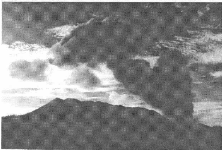
August 2001 - Matupi volcano emitting its daily clouds of ash and steam Rabalanakaia (or Rabalnakaia?) volcano in foreground