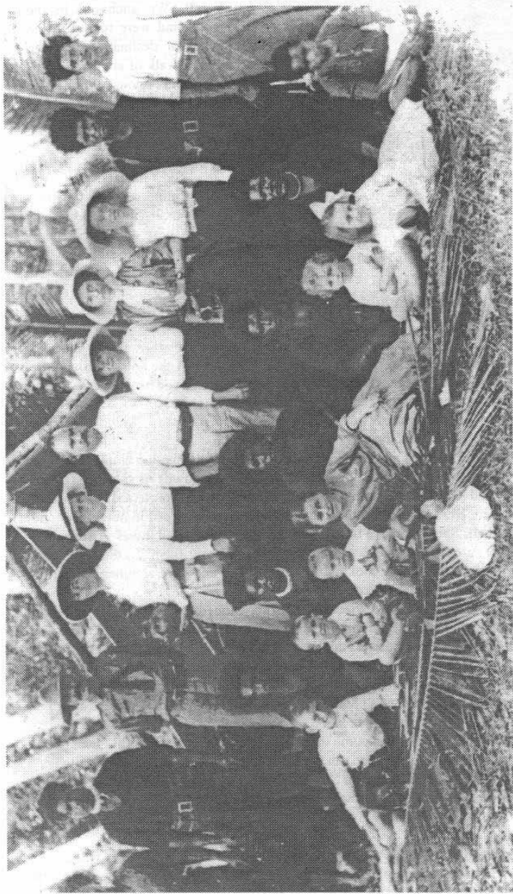
PICNIC AT BONAGAI, WOODLARK ISLAND